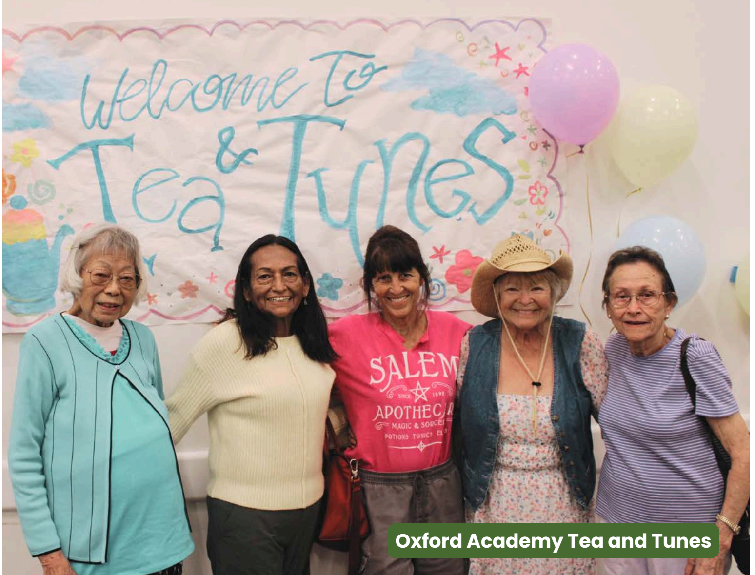
Oxford Academy Tea and Tunes

May 2026 | Cypress Senior Center | cypressrec.org | Monday-Friday, 8 AM-5 PM | (714) 229-6670