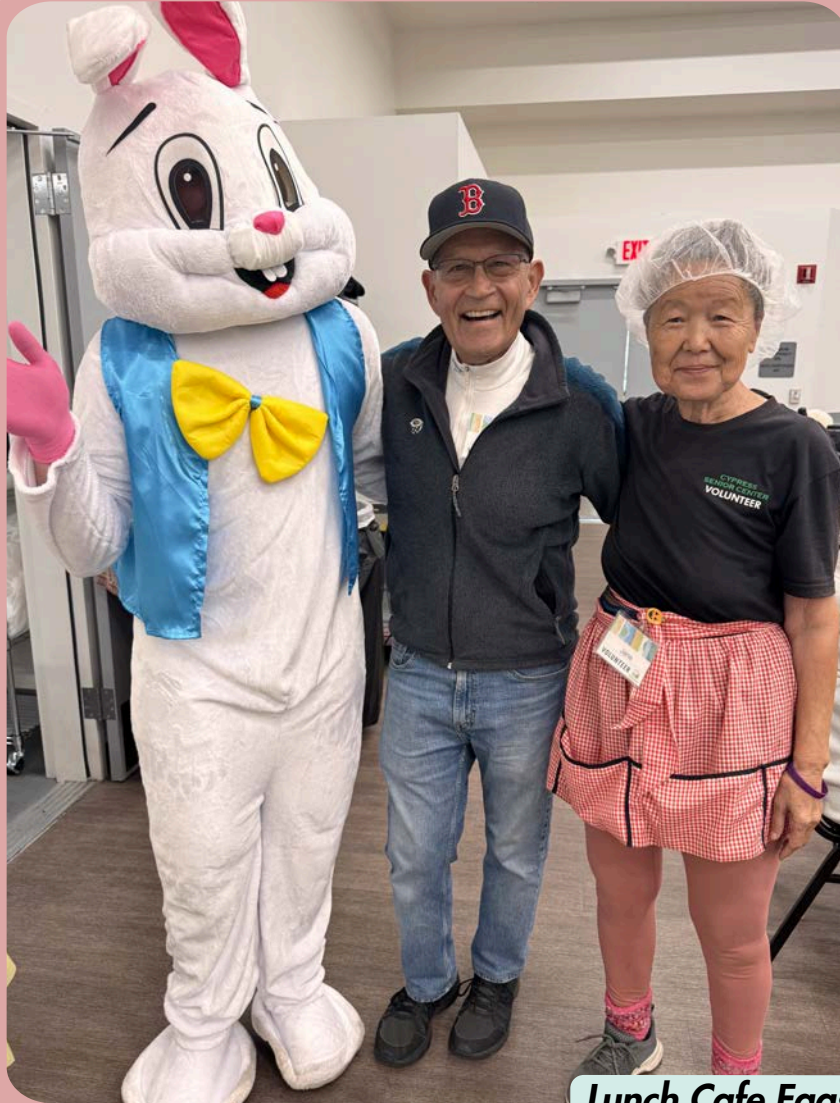
Lunch Cafe Eggstravaganza 2025

April 2026 | Cypress Senior Center | cypressrec.org | Monday-Friday, 8 AM-5 PM | (714) 229-6670