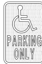
SIGN R99 (CA)