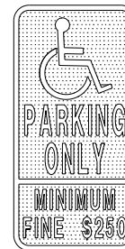
SIGN R99C (CA) See Note 3